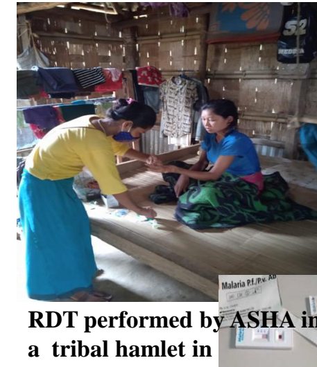
RDT performed by ASHA in a tribal hamlet in Dhalai, Tripura