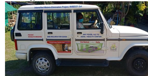
Vehicles with IEC messages provided to State and District HQ to facilitate Monitoring visits (GFATM support)