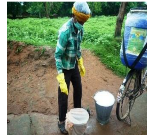
Preparation for Indoor Residual Spray