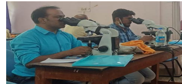
Bivalent Microscopes provided to Lab Technicians for microscopy at CHC level.