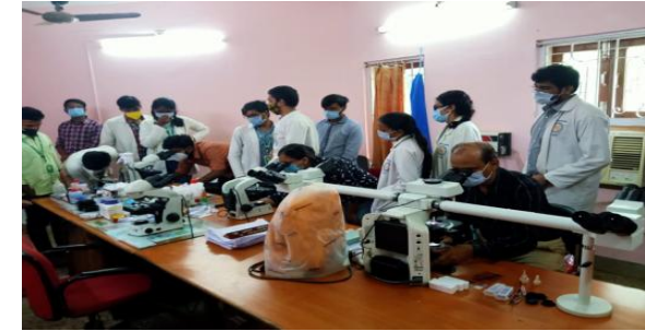
Training of Lab Technician using Pentavalent training Microscope