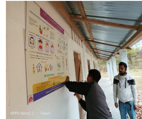
Fixing of IEC Board (Malaria) in a Schools in Manipur