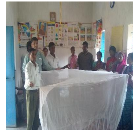
LLIN usages demonstration to beneficiaries during LLINs distribution